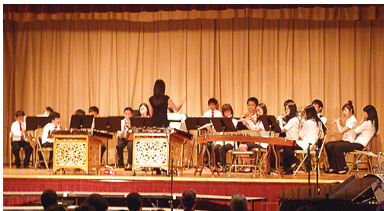
The CCS band was one of numerous musical groups that performed at the Spring Concert.