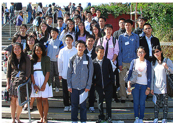
Seventy students won 35 awards at the Northern California Mandarin Speech Contest.