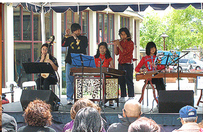
The Young Swallows performed at the Alameda Towne Center during the inaugural Asian Pacific Heritage Celebration.