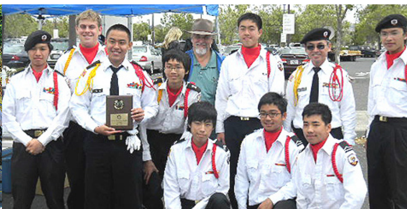
The Color Guard placed first and the Drill Team 2nd in the Rowell Ranch Rodeo Parade.