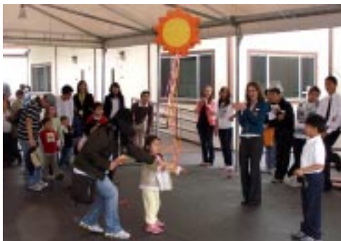
Younger children enjoyed the chance to open a Pinata sponsored by the Spanish Department.