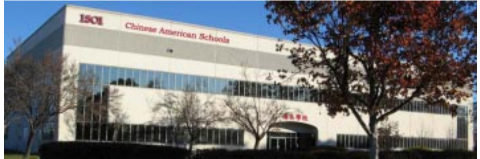
The new school will be adjacent to the Alameda Campus