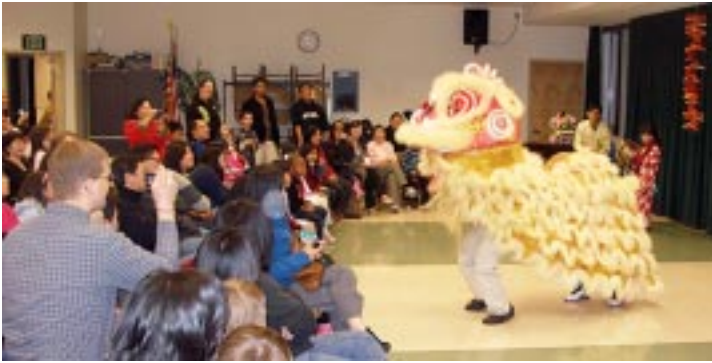
A lion dance was part of the Alameda PTF Social festivities.