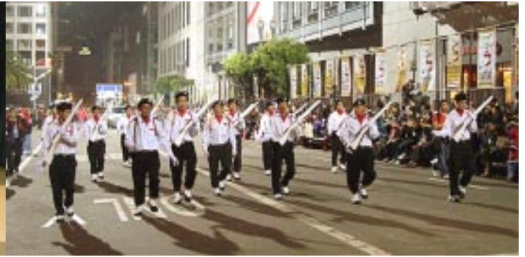
The Marching Units in the SF Chinese New Year's Parade.