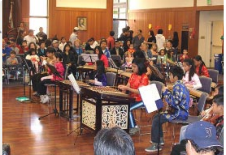
The Young Swallows play at the San Leandro Library.