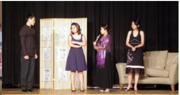
Student actors perform in the student produced drama.