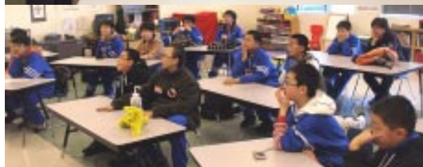
Top: Wanbang School sister school agreement signing; Bottom: students from Beijing visit the Alameda campus.