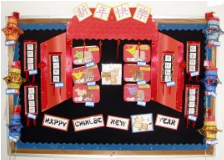
New Year's cards on display in San Leandro.