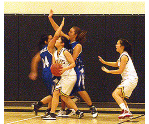
The varsity teams look forward to their first season with a true home court to defend.