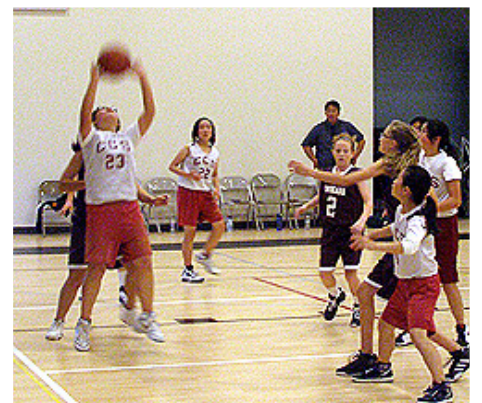
The middle school boys and girls teams enjoy their inaugural season.