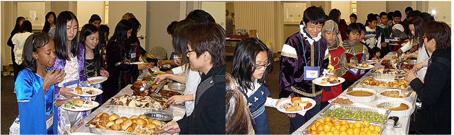
For lunch, the 7th graders enjoy eating foods harkening back to the Medieval days, including roasted chicken and pork.