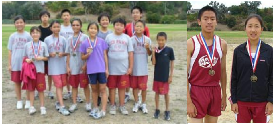
Cross country runners displaying their medals earned at recent meets.

The CCS FIRST Robotics Team is gearing up for its 3rd competition and needs boosters to help raise funds and provide the logistical support necessary to mount a good effort. Whether you can provide time, expertise, food, or monetary support, everyone is welcome to participate. The Robotics competition is a cause the whole CCS community can rally behind so our students can compete on an equal footing against the other, much larger schools participating.