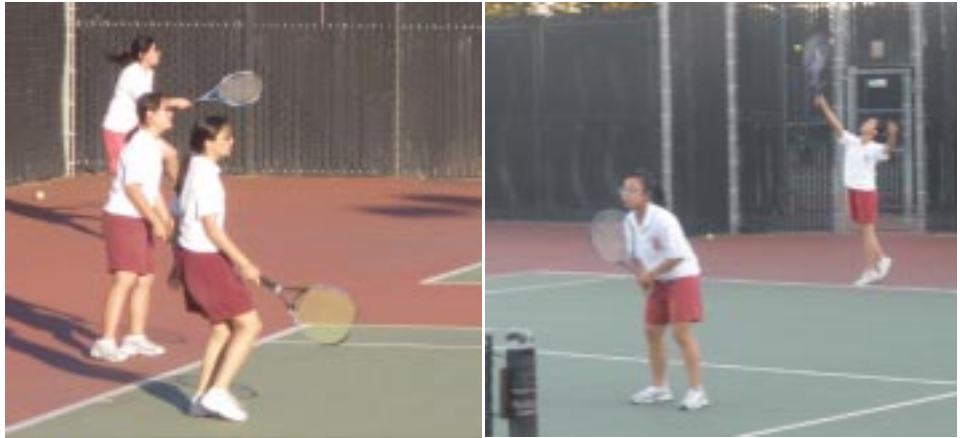
The Girl's JV Tennis Team displayed mental toughness during competitions.