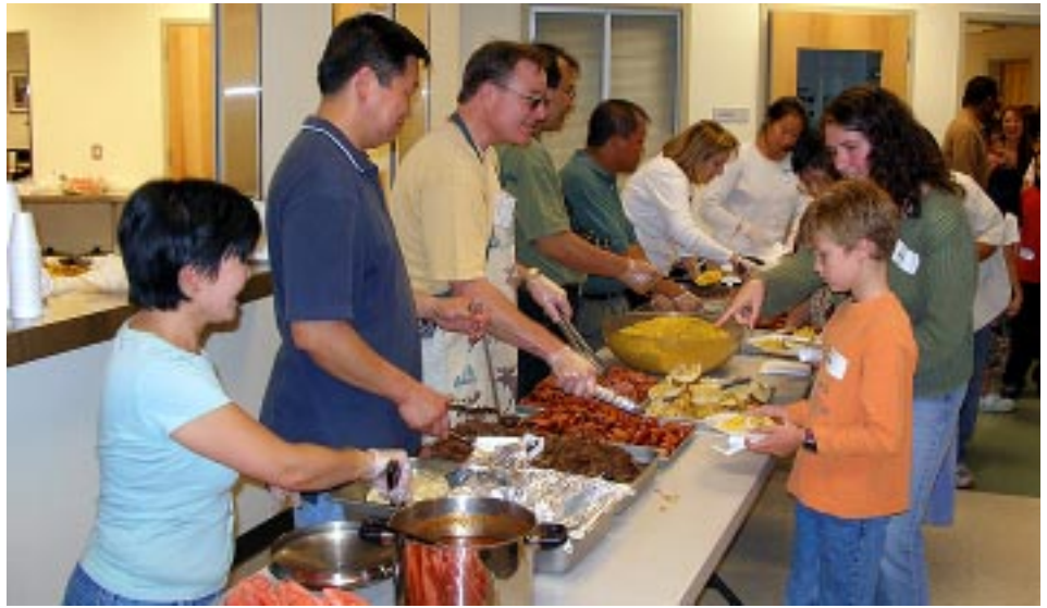
Alameda PTF Council members serve dinner at the first social. The next event is "Take Your Parent to Lunch" on November 15. Stay tuned for more information about the next San Leandro PTF meeting.

Tuesday, March 27 , is a minimum day due to teacher's training.