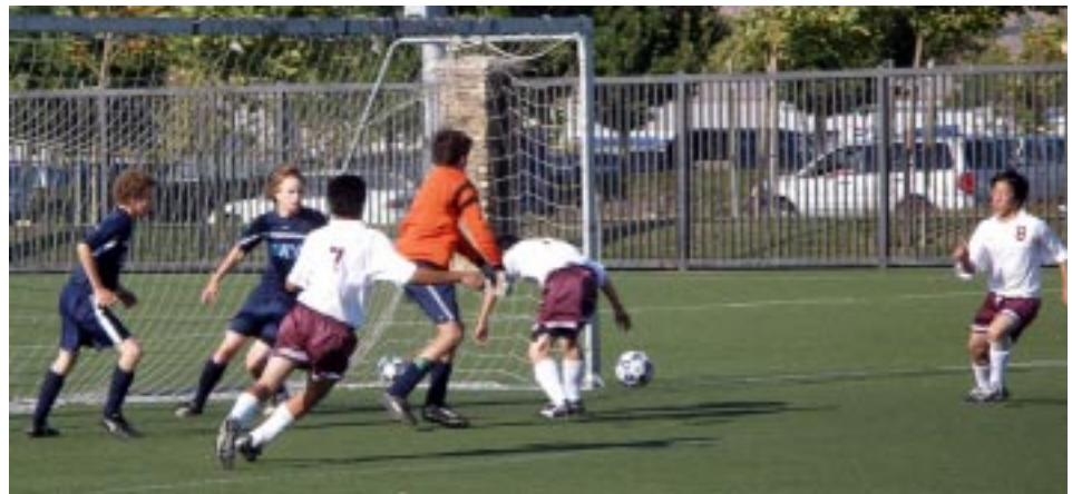
The Boys Soccer Team is advancing to the play-offs through aggressive play at their opponent's goal. A dinner to honor all fall sports athletes will be held on November 18. Contact any athlete or the school office for tickets to attend and show your support.